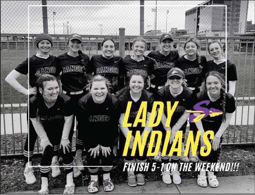
Sanger Lady Indians Varsity Softball