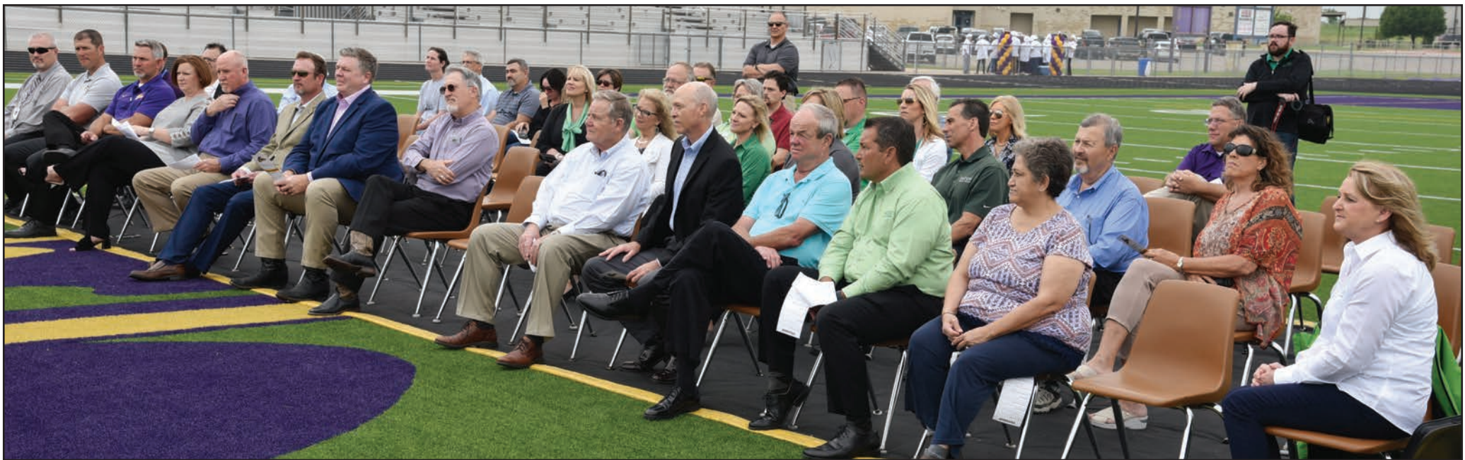
Attendees listen to how the SHS Career and Technology Education program benefits from the new videoboard courtesy of DATCU.