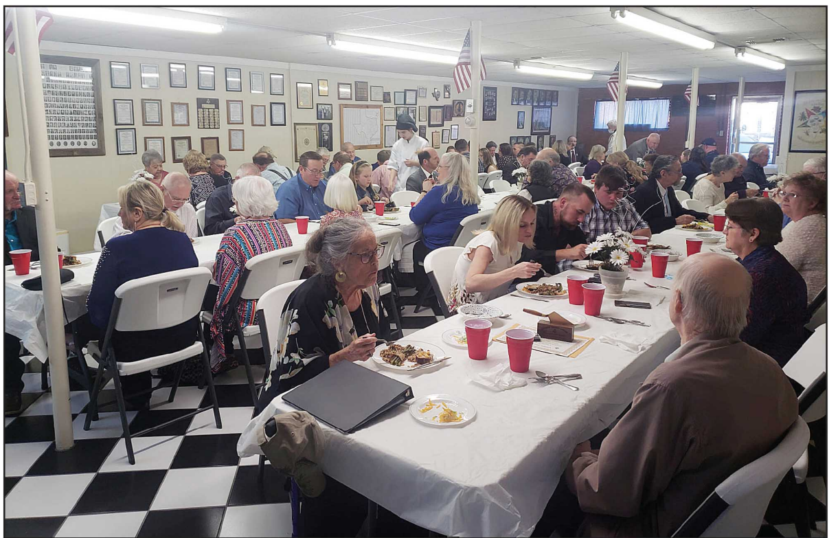
ABOVE: Approximately 70 people were at the event.