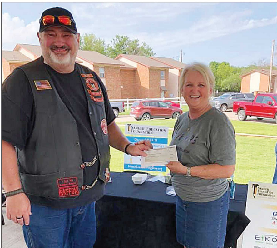
BROTHERS KEEPERS MC DONATES $1000 TO SANGER EDUCATION FOUNDATION - Because of the turn out at the wrestling event in June, it enabled the Brothers Keepers MC to be able to present Sanger Education Foundation with a check for $1000 on Sunday at the Sundae Stroll.