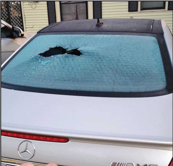
One of three vehicle windows shot out at a residents home on Fifth Street last week.

Perkins confirmed a total of five vehicles were stolen by these four. He couldn't go into more detail, but it involves multiple cities. One of the vehicles was burned, and neighborhood surveillance video shows the suspects in the white Malibu, following one of the stolen vehicles in Fort Worth.