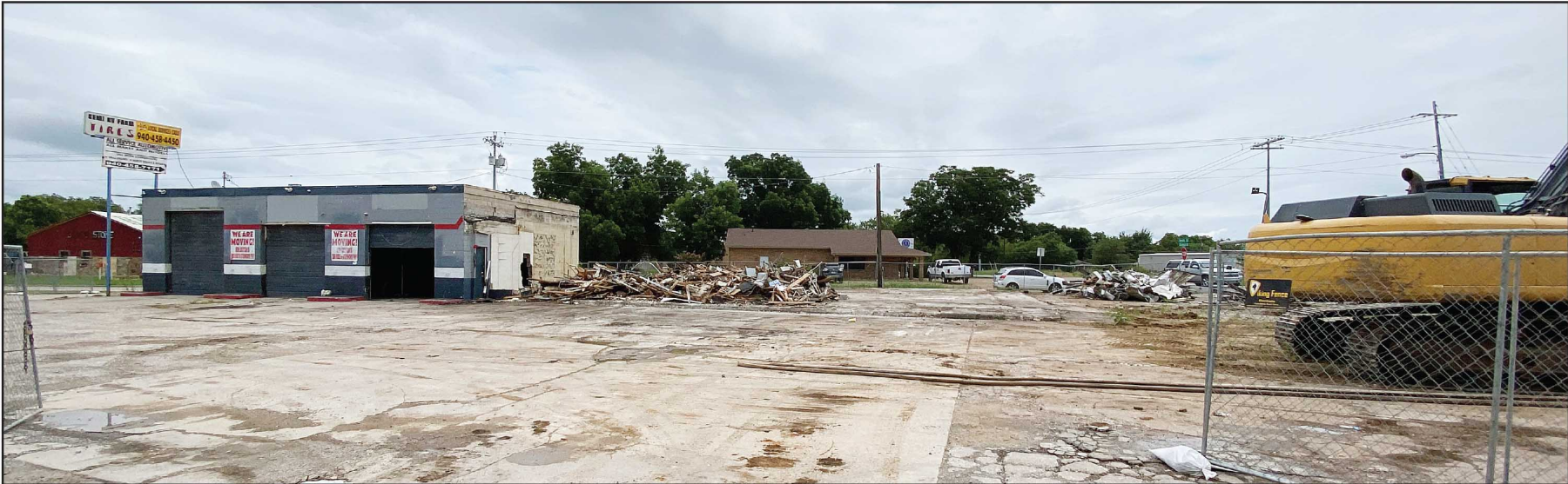
The Snap Shop Convenience Store was demolished this week for the expansion of Highway I-35 and FM 455 TxDOT road expansions.